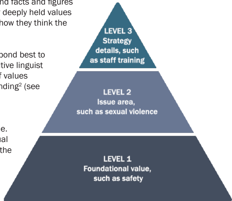
Figure 1. Conceptual levels

All three levels are important and necessary, but it's easy to get stuck at level three, mired in minutiae. Inundating people with facts and figures is unlikely to shift people's thinking, especially if those facts are out of sync with their underlying beliefs. Voicing shared values helps people connect with prevention and recognize its importance. Ultimately, values are what motivate people to act.