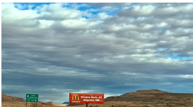
Figure 1: McDonald’s billboard, Shiprock, New Mexico, Navajo Nation.

How advocates frame the issue of target marketing will determine whether the public, policymakers, and even marketers themselves, see the problem.