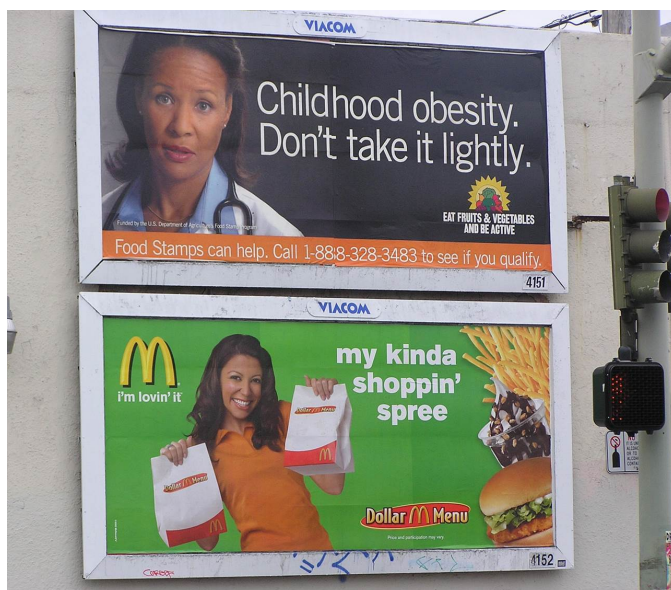
Figure 2: Street corner in Oakland, California, with billboards advertising an obesity prevention campaign above a promotion for McDonald's Dollar Menu.

and beverage marketing in their research reports, on their websites and in other materials. We found that although ethnically targeted marketing of junk food to children is clearly documented in published research, and many documents address marketing to children in general, few explicitly focus on targeted marketing or include images of children or families of color. Many documents mention health disparities, but most fail to explicitly connect the problem to junk food marketing — or why it is a health equity issue.