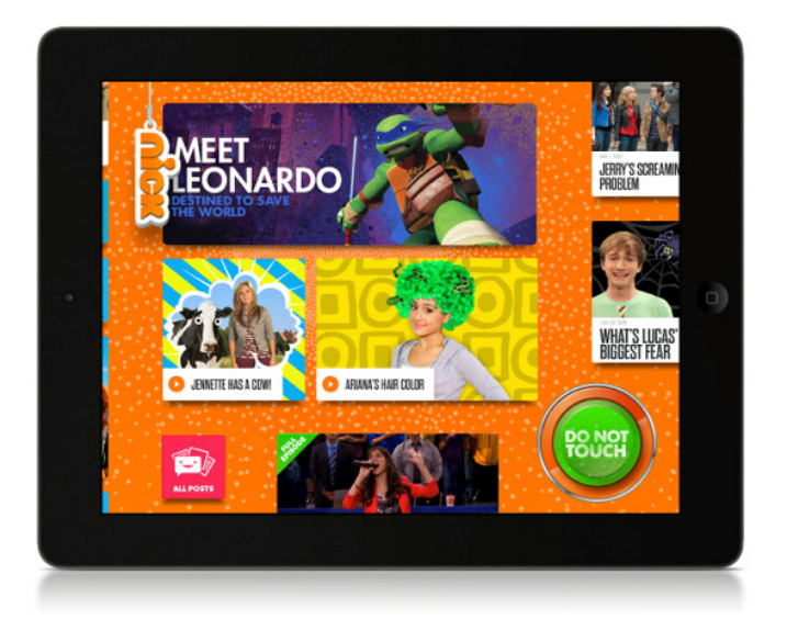
Figure 3: "Nick App" a multi-dimensional digital experience, not just TV episodes (iPad version)<sup>50</sup>

Applications (apps) for mobile devices like tablets and smartphones are a core element of Nickelodeon's child-targeted strategy going forward. The company estimates that some seventy percent of U.S. households have a mobile device, and that tablet use is growing faster among children than any other group.<sup>27</sup>