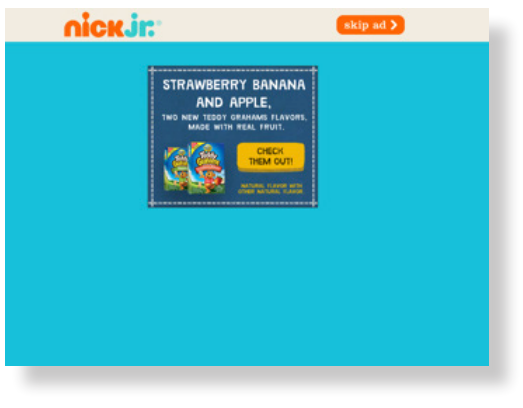
Figure 1: Nick Jr. Interstitial Ad Featuring Teddy Grahams

Food advertisements on Nickelodeon's websites commonly appear as display ads, ranging from banners or sidebar ads to "interstitial" ads, which the viewer must watch before a webpage loads. A recent visit to the preschool-aged targeted NickJr.com included an interstitial ad for Teddy Grahams, promoting that cookie's fruit content (Figure 1).